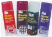
Photo mount adhesive

There are a number of different mount adhesives around but for photos you need one that is pH neutral. Any adhesive containing acid could discolour an image over time. 3M PhotoMount in the red spray can is a good product. Costs about £5 for a small can, £12 for a larger 400ml one.