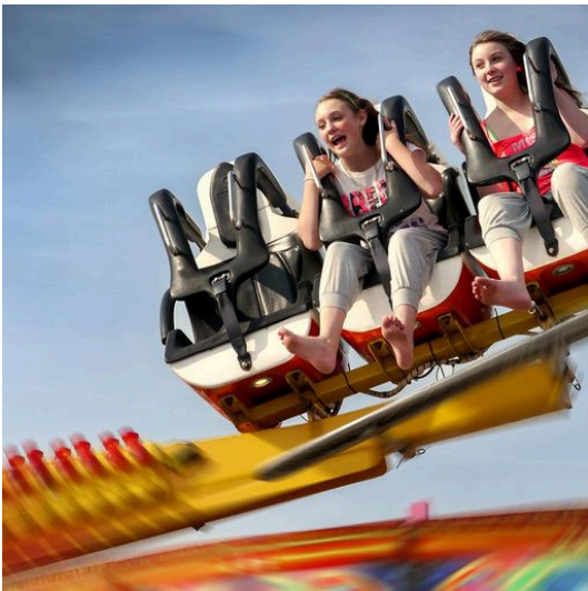
General - 'They know no fear' by Nigel Longman