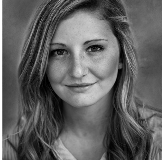
Intermediate - 'Beth' by Tracy Bradbury