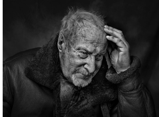
CONTEMPLATING by Brian Gough

In round 2 are most successful image in the Print's was Steve Hunter's image again of 'Japanese Pines in Sunset' which also was a starred image and in the PDI's Alison Trimbee's 'Milkyway at Tyneham' as shown below.