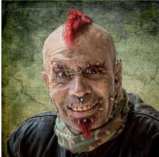
SPIKE by Alan Sturges

Brian Gough's 'Contemplating' as shown below