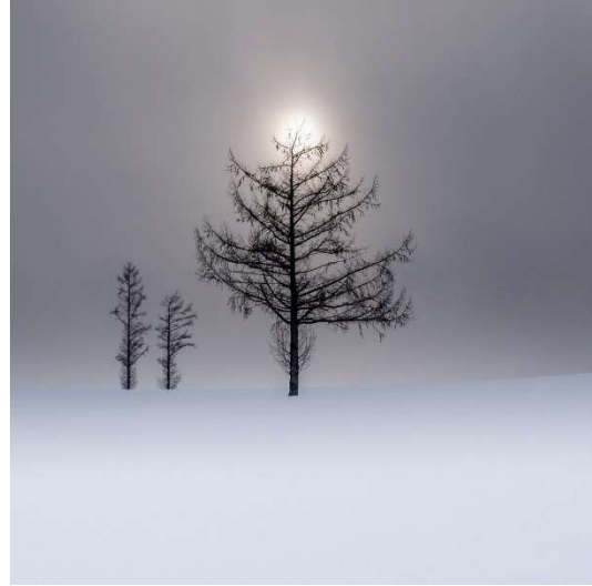
JAPANESE PINES AT SUNSET by Steve Hunter

We have competed in two rounds of the NWF against Field End and Hemel, we came 2 nd in round 1 and first in round 2.