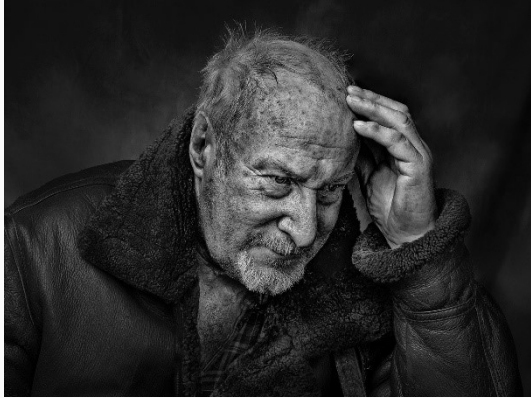
CONTEMPLATION