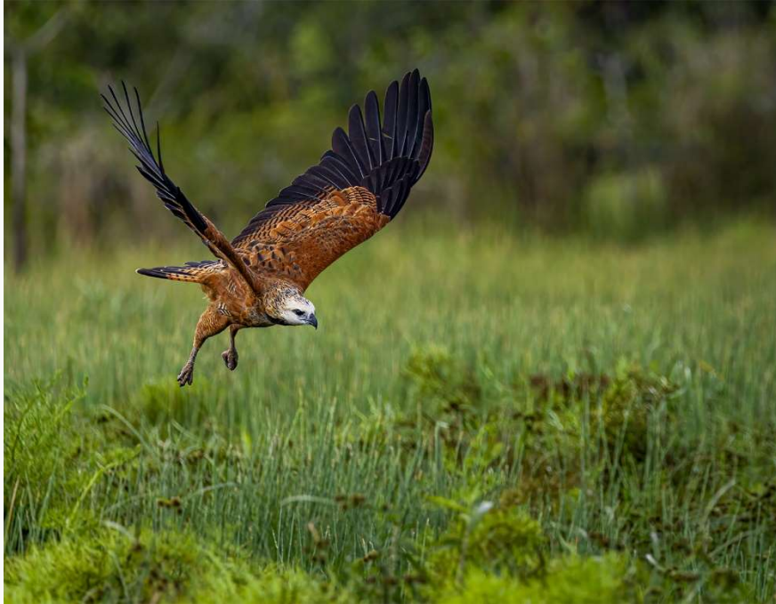
Intermediate - BLACK COLLARED HAWK by John Allport