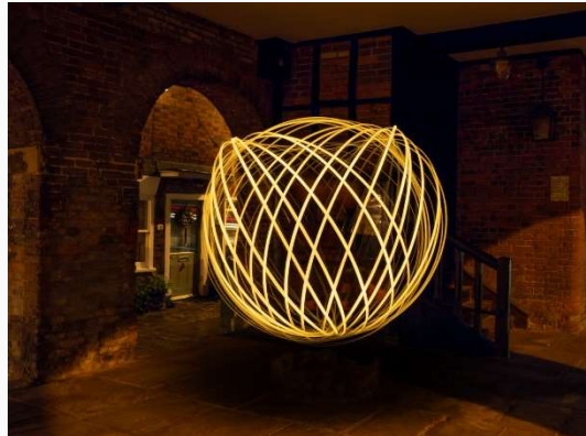
MYSTERY UNDER THE MARKET HALL by Patrick Hudgell

Last week we explored Kings Cross and the surrounding area. It was a very bright & extremely cold day but enjoyed by all. A selection of our images taken on the day will be up on the club outings Flickr page soon.