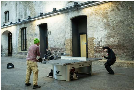
TABLE TENNIS by Gill Morgan

Last week we explored Kings Cross and the surrounding area. It was a very bright & extremely cold day but enjoyed by all. A selection of our images taken on the day will be up on the club outings Flickr page soon.