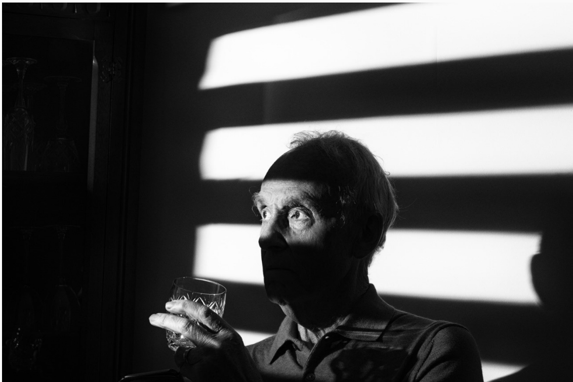
#42 FILM NOIR 4 by Peter Lillywhite