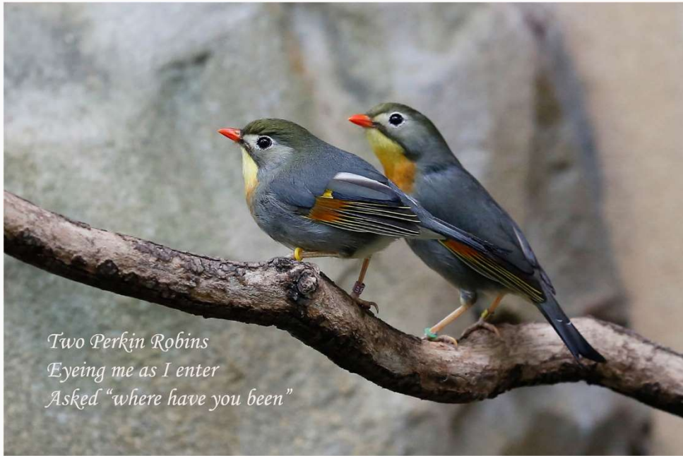
#41 TWO PERKIN ROBINS by Yin Wong