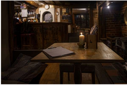
AWAITING DINERS