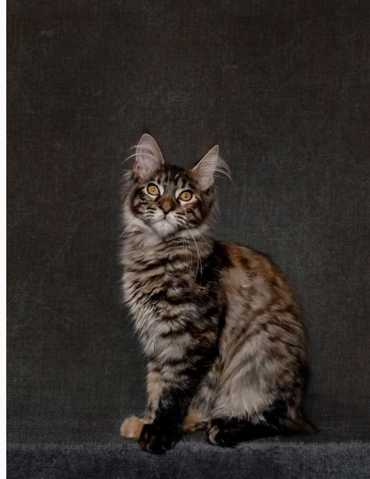
By Tracy Bradbury