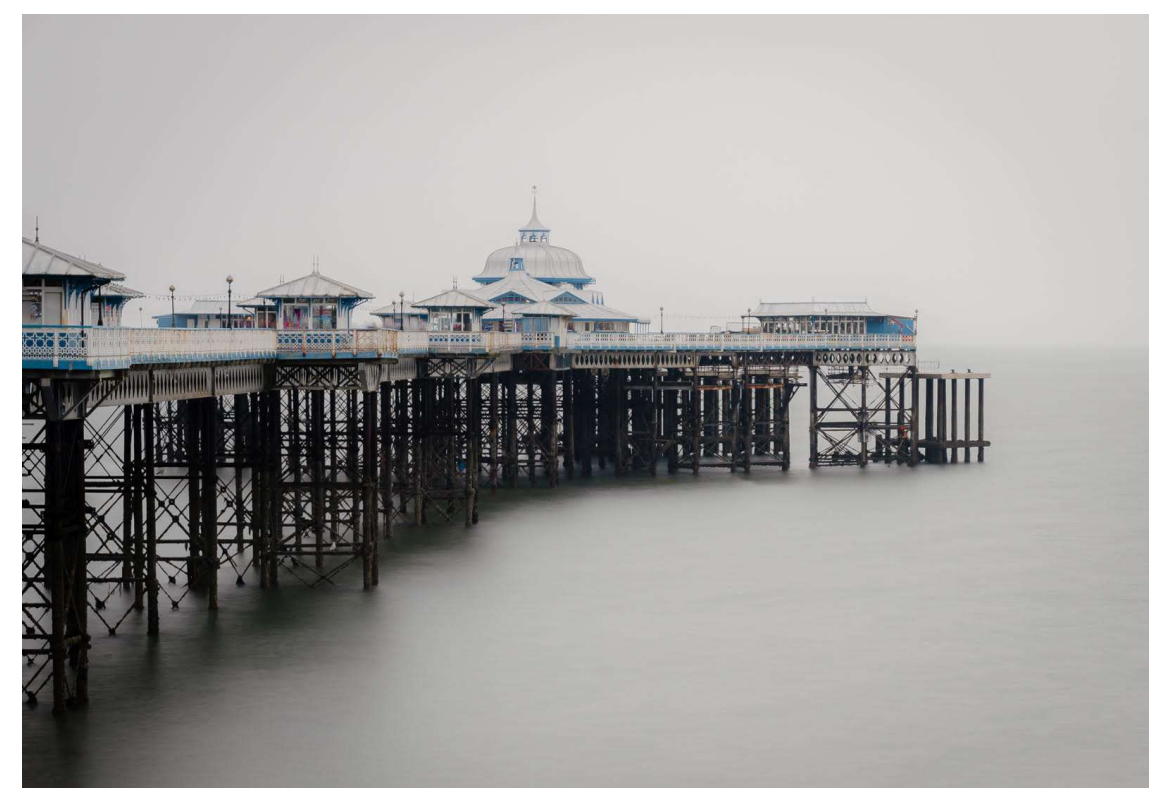
General - LLANDUDNO PIER