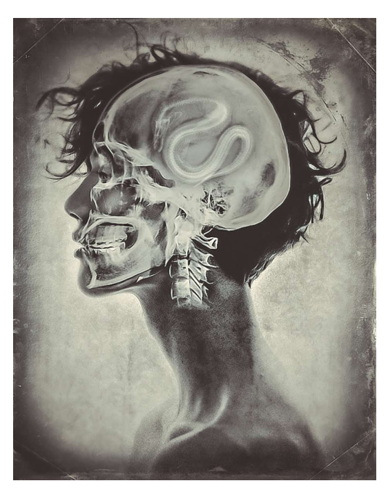
#44BLEND MODES B by Tracy Bradbury