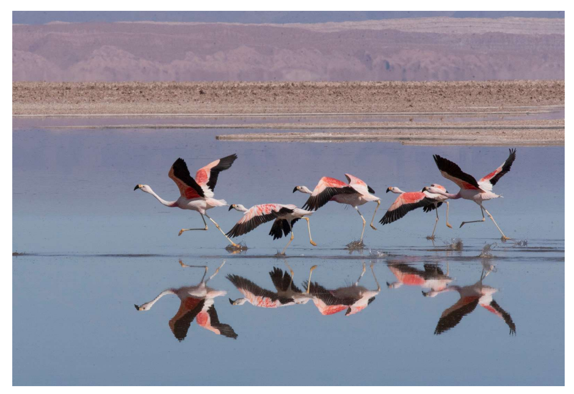
Intermediate - FLAMINGOS IN FLIGHT by Sylvia Morris